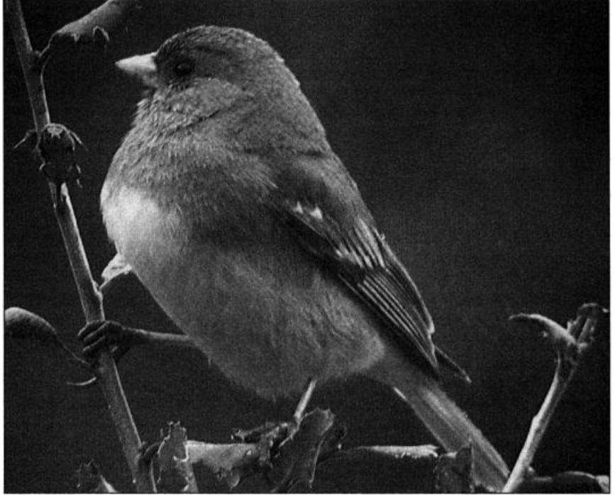
Perhaps a once-in-a-lifetime event was the genuine invasion of White-winged Juncos into the Southwest and as far as California. This beauty was photographed 11 March 2001 in the Molino Basin of Arizona's Santa Catalina Mountains.