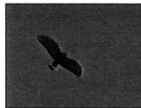
An astonishing find was this Zone-tailed Hawk at Boca Grande Key 12 December, a vagrant hardly known in the East.