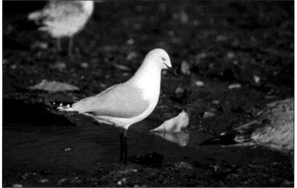
A Silver Gull, first noted in the autumn at Brown's Station Landfill, Maryland, has been presumed to be an escapee from a bird collection. This photograph was taken on 30 November 2000.