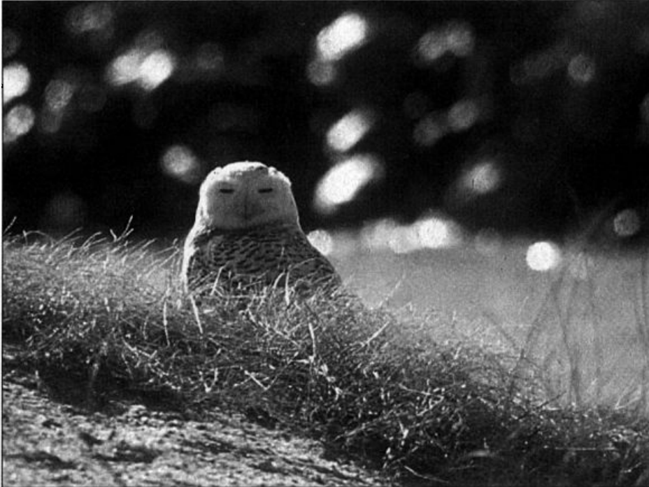
This Snowy Owl at Windmill Point, Virginia attracted hundreds of admirers through its long stay.