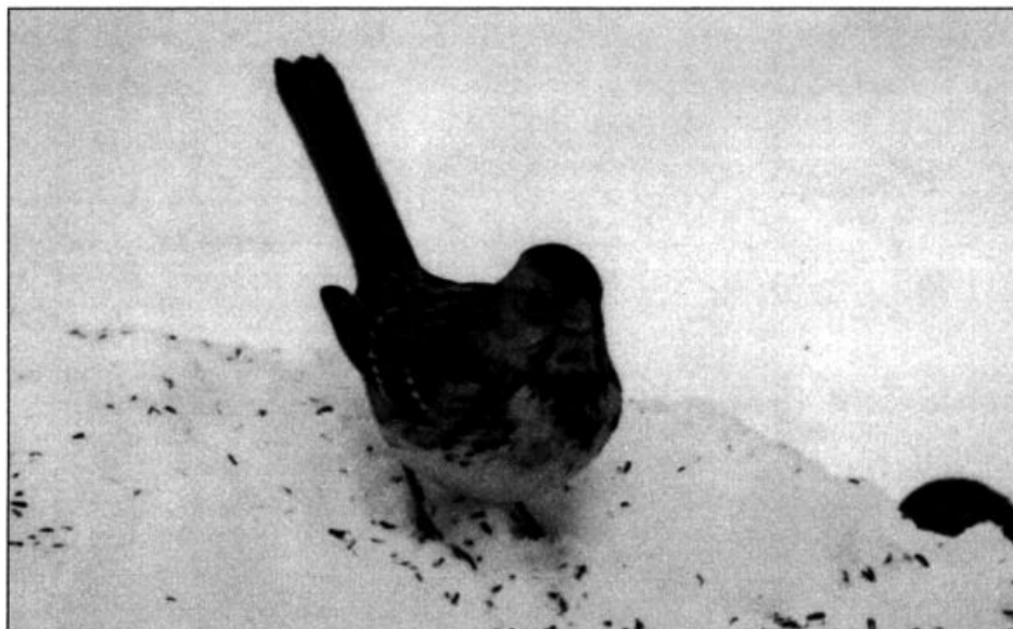
One of two Harris's Sparrows found in the province over the winter was this bird at l'Ange-Gardien. It was seen from 5 December through the winter.