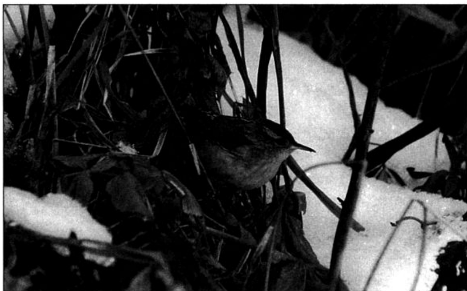
This Marsh Wren, photographed at La Baie 3 December, was the second ever for the Saguenay-Lac-Saint-Jean region.