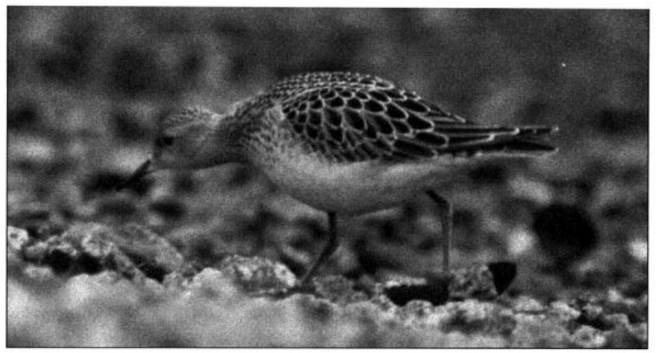
Furnishing one of few records for St. Lawrence Island, Alaska, and fairly close to the Asian continent, was this juvenile Buff-breasted Sandpiper at Gambell 29 August 2000.

Despite excellent sea-watch coverage, no Arctic Loons were identified moving past Gambell. At least 5 in the Nome area between 25 Aug-2 Sep (WINGS) and a single in basic plumage at Attu 26 Sep-2 Oct (ATTOUR) were more significant; casual in the Aleutians, the latter appears to be the first in fall. Two Pied-billed Grebes in the Ketchikan area 16-29 Oct (SCH, AWP) furnished the season's only report. Noteworthy Red-necked Grebes included 3 around Gambell 10-14 Sep (WINGS) and 6 in Nome 2 Sep (WINGS), areas where uncommon to rare, and an unusual single-day count of 12 from Attu 28 Sep (ATTOUR). A few early November birds from Anchorage (DFD) and one from King Salmon 4 Nov (DR) were late even for mild conditions. After the past few year's increases, an ımm. Short-tailed Albatross off Kodiak 9 Nov (DM) provided, disappointingly, the sole report. Pink-footed Shearwaters, annual in small numbers in the massive Gulf and North Pacific/Bering Sea shearwater flocks, were finally documented by photos of a single bird in the North Gulf 13 Aug (ph. DWS), and formally added to the Alaska list. Another was noted far-