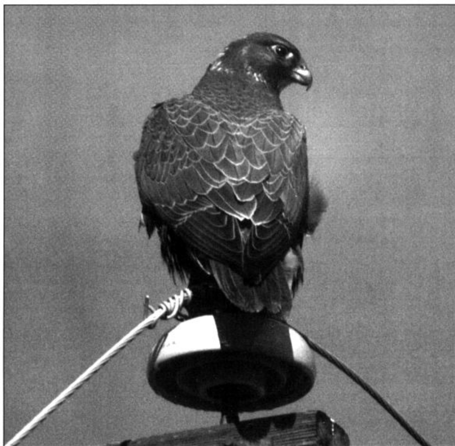
This gray immature Gyrfalcon at Muskegon Wastewater System, Muskegon, Michigan, proved more cooperative than most other birds of this near-mythic species. It remained 26 October–27 November 2000, allowing numerous individuals to observe it. The image was captured on 10 November.

Lingering warblers were too numerous to mention. A Northern Parula was record-late for n Minnesota in Lake 4 Nov (KE). Also late were Cape May Warblers in Portage , WI, 2 Nov (MB), and Iosco , MI, 26 Oct (JZ). Michigan had single Prairie Warblers in Wayne 13 Sep (WP) and Keweenaw 19 & 21 Sep (LCB). Not previously relocated, June's Yellow-throated Warbler was at William O'Brien S.P., Washington , MN, 2 Aug (AH, RJ). Almost record-late was the Bay-breasted Warbler in Hennepin , MN, 29 Oct (TT). A Common Yellowthroat lingering in Rice , MN, 17 Nov (TB) presumably survived, but one was picked up dead in Duluth 22 Nov ( fide KE). In spite of being found along the North Shore of L. Superior for three consecutive Octobers, 1997–1999, Minnesota's only Summer Tanager came to a feeder in Faribault, Rice , 15–25 Nov (TB). One in Marquette , WI, through 9 Aug (JM) had been present all summer.