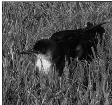
The equal of the Middlewestern Prairie's Red-cockaded Woodpecker (see the Pictorial Highlights) for bizarre record of fall 2000, this Manx Shearwater was found alive at Armada Township, Macomb, Michigan, 19 August 2000. Rehabilitation failed; the specimen, an adult male, is now at the University of Michigan Museum of Zoology. Remarkably, the bird had been banded as a chick near Belfast, Northern Ireland, in September 1991.

For the second consecutive year, a Mew Gull was found in Milwaukee , WI, this time an adult brachyrhynchus 11 Nov+ (ph. JI & SL). A second-winter California Gull at Bradford Beach, Milwaukee , 5 Nov (SL) would provide the 5th Wisconsin record, if accepted. In Minnesota, adult Thayer's Gulls were record-early at L. Calhoun, Hennepin , 23 Sep (PB) and Duluth 24 Sep (PS). Thayer's were in seven e. Wisconsin locations, while Michigan