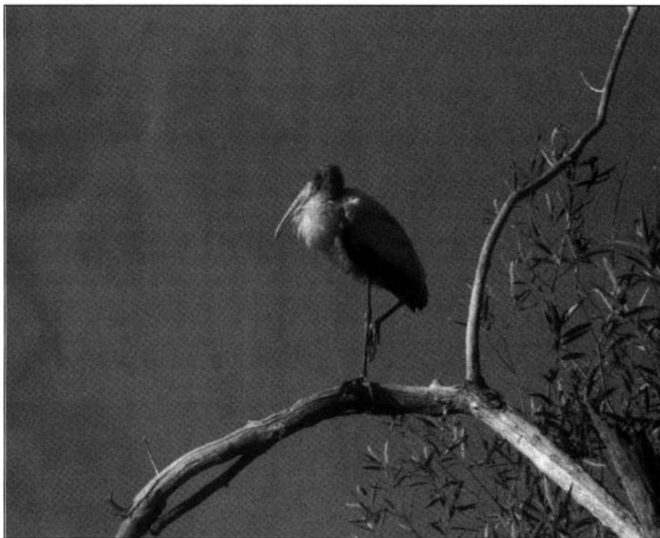
This immature (note the pale bill and feathered head) Wood Stork at Presque Isle State Park, Erie, 1 October–11 November 2000 established the first record for northwestern Pennsylvania.

There were some good fallouts of shore-birds locally, including 17 species that came down during a rainstorm 6 Aug at Big Beaver wetlands, Beaver, PA (BD, JF). Among many reports of Black-bellied Plovers was a high count of 17 at Hooper Lane, NC, 31 Aug (WF,