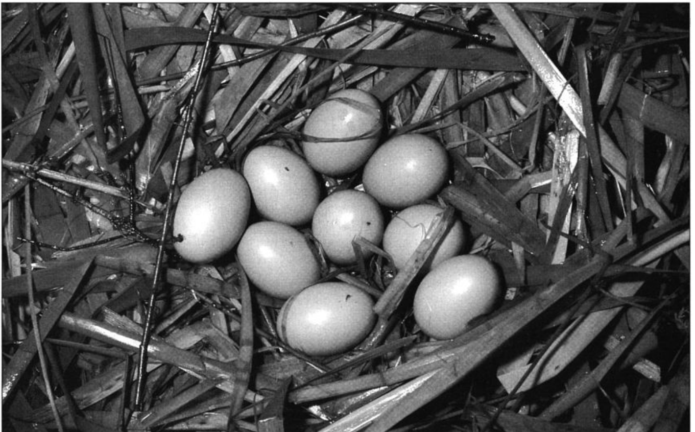
A Canvasback nest with nine eggs at Tommy Thompson Park near Toronto 11 Jun 2000; see cover and report for details of this first nesting record for Ontario.