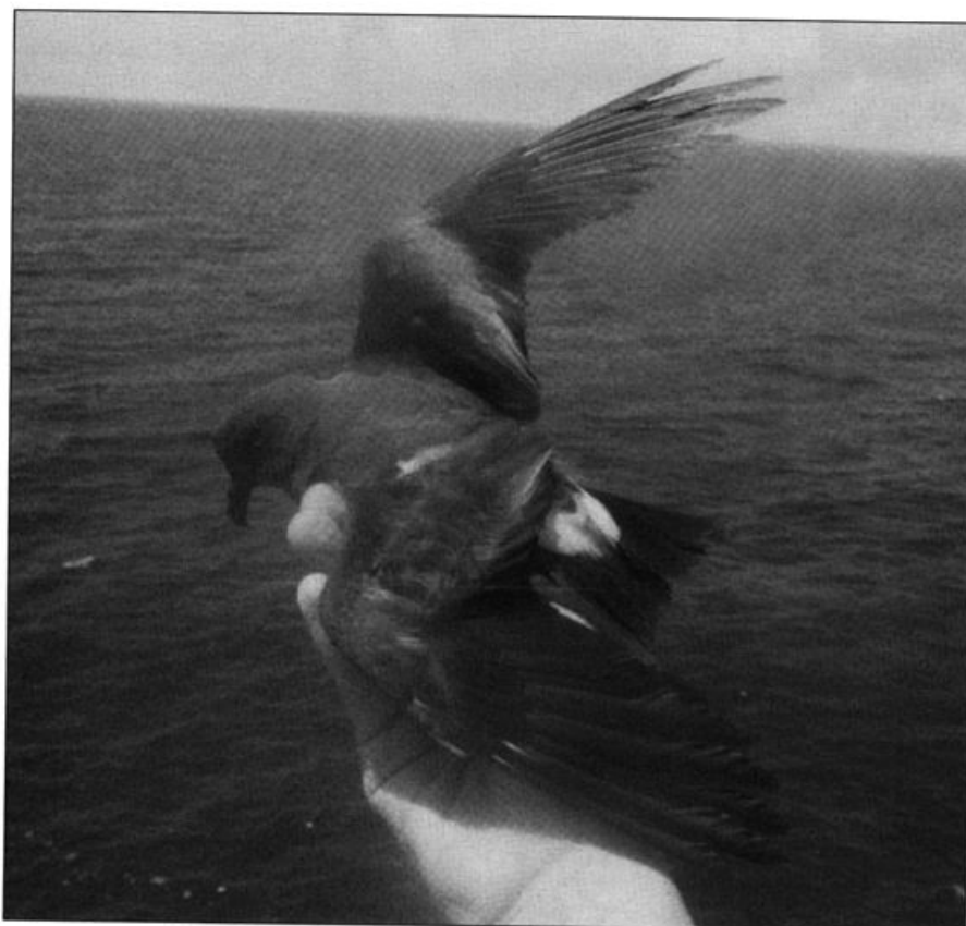
With increased pelagic coverage of the northern Gulf of Mexico, Leach's Storm-Petrel is proving to be rare but regular. This one was captured at an oil platform off Louisiana 12 May 2000 during Louisiana State University's on-going study of migration across the Gulf.