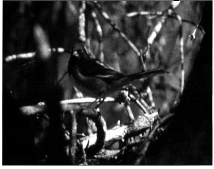
Sparrows were received for the period; virtually all were believed all were believed The Southwest's first Eastern Towhee was this male at Patagonia-Sonoita Creek Sanctuary from late Dec through the winter. It was seen by numerous observers, had various calls recorded, is videotaped, and was photographed by many; this image was from 13 Feb 2000.