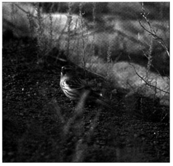
The thousands of Common Redpolls that pushed southward during fall 1999 and continued into winter 1999/2000 were accompanied by a few Hoary Redpolls, such as this female at Presque Isle State Park, Pennsylvania, 10 Feb 2000.