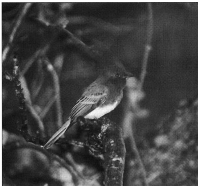
A state and likely Regional first was provided by this Black Phoebe at Webbers Falls Wildlife Management Area, Oklahoma, 27 Oct–30 Nov 1999. This image was captured 30 Oct.

Bluff 3–4 Sep (SJD) fell within the window of only six other reports for Nebraska 15 Aug–9 Sep ( vide WRS). The only Red Knots reported were five in Osage , OK, 27 Aug (JWA), two in Alfalfa , OK, 9 Sep (JWA), and a tardy bird at Hefner 5 and 10 Oct (JW). A Semipalmated Sandpiper in s.-cen. Nebraska 10 Oct (JGJ), the latest documented for Nebraska ( vide WRS), was outdone by one documented 24 Nov in Oklahoma (JAG). A species to be watched, the 32 Buff-breasted Sandpipers 1 Aug in s.-cen. Nebraska ( vide WRS), and the 75+ 6 Sep in Wagoner , OK, (JM, JN) were the best counts of a generally modest showing. A Ruff was documented in Kingfisher 2 Aug (JWA, JL), the potential second for Oklahoma if accepted by the O.B.R.C. Dowitcher observations followed a typical pattern. Nine adult Short-billeds were at Phelps , NE, 1 Aug (LR, RH), and 12 juvs. were in Scotts Bluff 3 Sep. (SJD). The best count of Long-billeds was 381 in s.-cen. Nebraska 10 Oct (JGJ). An Am. Woodcock in Garden , NE, 6 Nov (SJD) may continue the pattern for this species in pressing westward. Red-necked Phalarope reports included one 4 Sep in Morton , KS, (PJ, m.ob.), 2–6 at Quivira 6–19 Sep (MR, SS, CG) and five in s.-cen. Nebraska 25 Sep (JGJ). Single Red Phalaropes were at Hefner 11 Sep (LM, SM et al.) and Quivira 19 Sep (MR, SS).