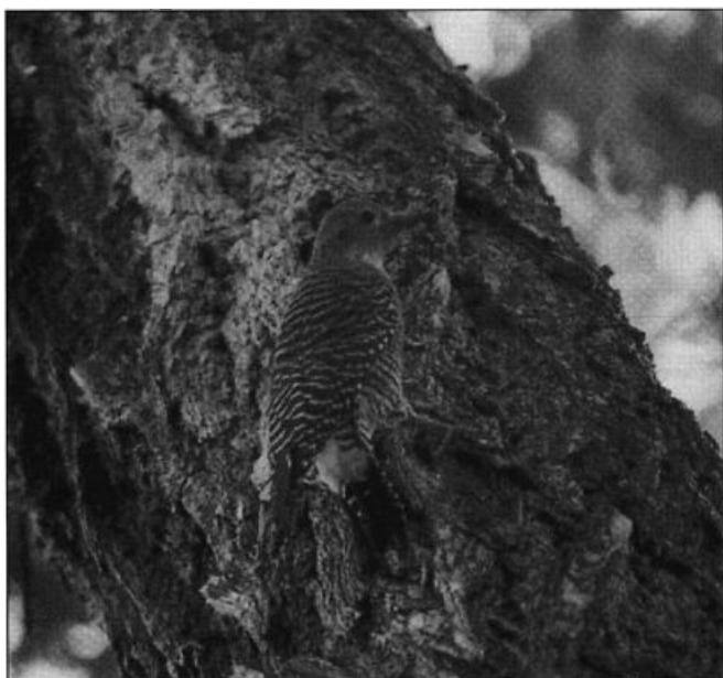
This confiding female Williamson's Sapsucker near Kenton 18 Sep 1999 represented only the second documented record for Oklahoma.