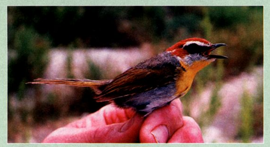
Mist-netted along the Devil's River in Val Verde County on 20 June, this Rufous-capped Warbler established the fifteenth accepted Texas record and was the first ever to be banded in the U.S.

A truly outstanding event for ornithology in the A.O.U. Check-list area was the occurrence of Little and Least Terns together for many weeks in breeding plumage when they can best be distinguished—followed by egg-laying by both species! The Least Tern in flight (left) was photographed 24 June by Peter Pyle (HRBP-1236); the Little Tern (right) was photographed 24 May by Bert McKee (HRBP-1237), both at Sand Island, Midway Atoll. Compared to the pale gray, noncontrasting rump and center tail of the Least Tern on the left, note the white rump and tail of the Little Tern which contrasts sharply with its gray mantle. See the SA in the Hawaiian Islands report for the exciting details.