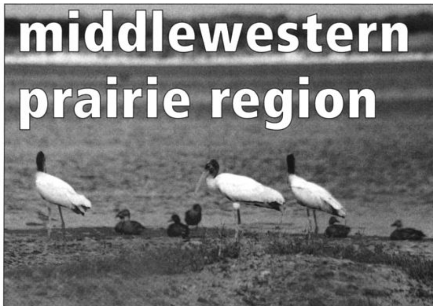
With the exception of a single immature present at Indiana Dunes in October 1998, these three immature Wood Storks at the Universal Reclaimed Mine Area in Vermillion County 24 July were the first reported in Indiana for more than half a century.