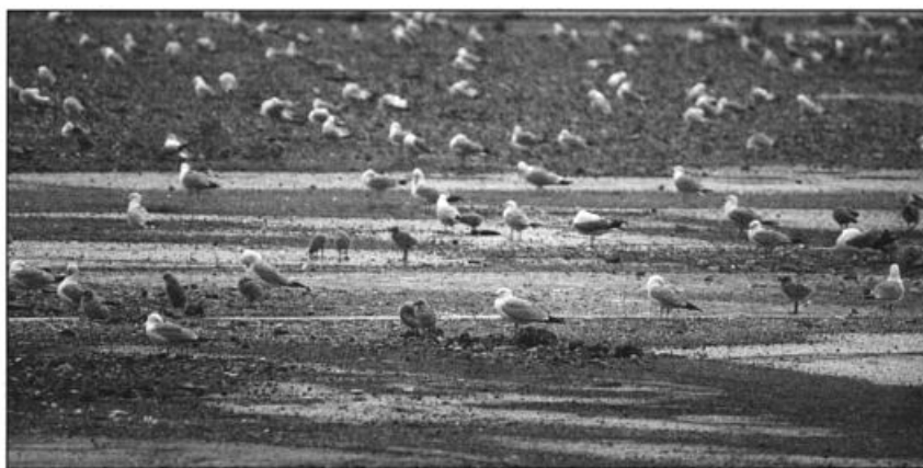
The juveniles interspersed among adults on 17 June at the General Electric Plant on the east side of the city of Erie document the first successful colonial nesting of Ring-billed Gull in Pennsylvania.

SA Three gull chicks delivered to Erie bird rehabilitator Wendy Campbell led to the discovery of the first successful nesting colony of Ring-billed Gulls in Pennsylvania. An estimated 700–800 adults, including many incubating birds, and at least 120 chicks were subsequently located in mid-June near the General Electric plant in e. Erie (LM, JM). The fact that so large a colony had gone undetected, presumably for several years, was no doubt due in part to birders having focused their attention on the favored destination of Presque Isle on the opposite side of Erie. Several previous Ring-billed nesting attempts at P.I.S.P. had all been unsuccessful.