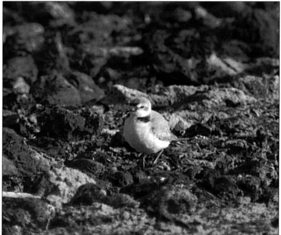
North Dakota's second Snowy Plover, at Grand Forks 1 May 1999.