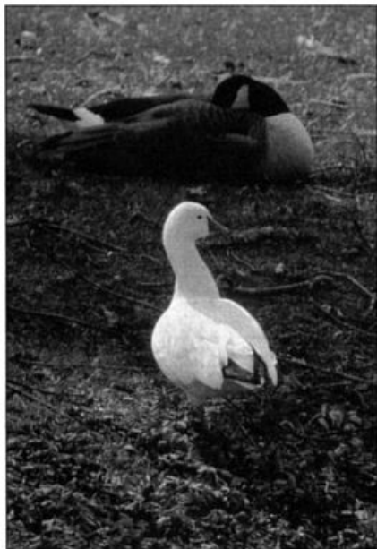
Adult Ross's Goose at Lavalette, West Virginia, 11–12 March 1999, one of many found throughout the East and Midwest as this species continues to increase.