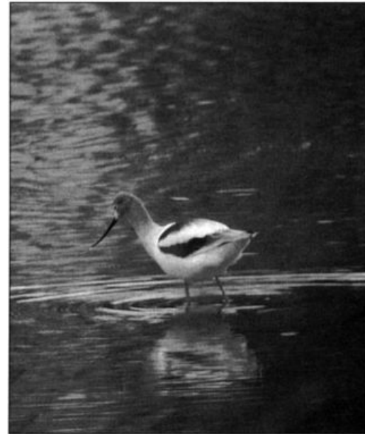
This male (note the relatively straight bill) American Avocet at Clintonville, Pennsylvania, 18 April 1999, was north of its normal range.