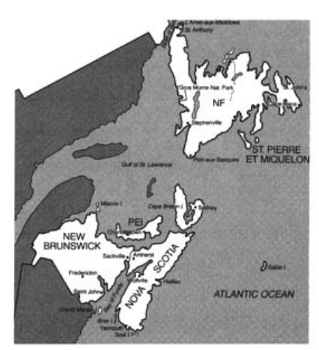
IAN A. MCLAREN

Winter began early and snow accumulated in northern and elevated areas, but La Niña's gift to southeast Newfoundland and much of the Maritimes was mild, often rainy, weather. In those parts, many lakes stayed open or froze episodically, and almost no snow stayed in coastal areas. The CBCs analyzed here will be mostly published only regionally. Unattributed sightings are fide subregional compilers.