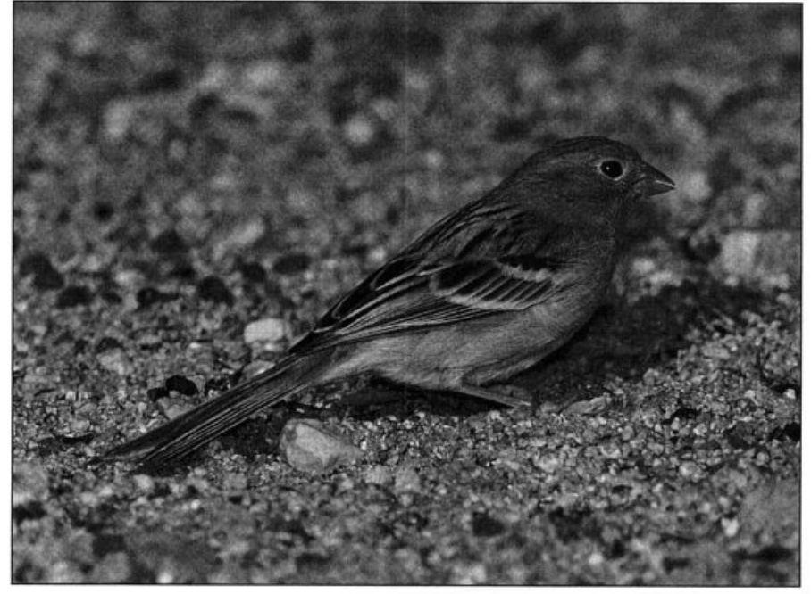
This Field Sparrow remained in Inyokern November 1-4 and is the first to be found in well-worked Kern County.

At least 30 Clay-colored Sparrows along the coast between Sep. 12 and the end of the period, along with at least seven more in the e. part of the Region between Sep. 26 and Nov. 29, was a few more than expected. A Field Sparrow photographed in Inyokern Nov. 1–4 (SSt) was the first to be found in Kern . At least a dozen Lark Buntings were found scattered throughout the Region between Aug. 30 and Nov. 3 for an average number. A migrant Nelson's Sharp-tailed Sparrow was at a vagrant trap in Morrow Bay Oct. 21–22 (WAB), and two were at a traditional wintering location in the marsh-