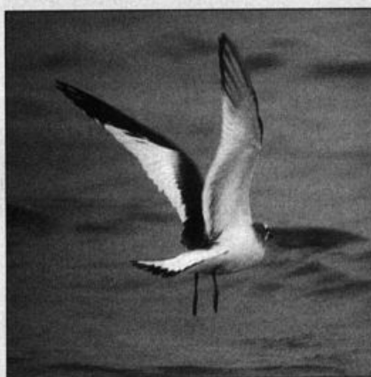
Sabine's Gull, one of 15-20 recorded this fall in Texas, on Lake Lewisville September 13.

An alternate-plumaged Black-bellied Plover Aug. 17 at L. Balmorhea was early for the Trans-Pecos (KB); another 12 in Abilene, Taylor , during the fall was an above-normal showing (LB). Three more Black-bellieds on Sam Rayburn Res., Nacogdoches , Sep. 19 (DF) were a good find for E. Texas. A count of 116 Snowy Plovers at Port Aransas Oct. 10 (including an albino) was a notable number (TA). Eight Snowy Plovers at L. Tawakoni, Rains , Aug. 6 (K & MWh) far surpassed previous counts at that site. A Snowy Plover at McNary Res. Oct. 28 (BZ) was very late. Single Piping Plovers were interesting finds at L. Balmorhea Aug. 20 (KB) and at L. Lewisville, Denton , Sep. 3 ( vide RR). Amos counted 323 Piping Plovers Sep. 14 in the Port Aransas area, a notable one-day count. The Mountain Plovers that have regularly wintered in