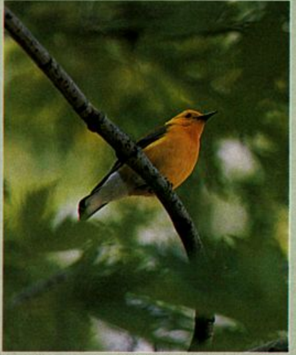
Among the most stunning of vagrant parulids and scarce anywhere in the west, this Prothonotary Warbler that spent a month in Missoula, Montana, was only that state's second. This handsome portrait was taken on June 18, 1998.