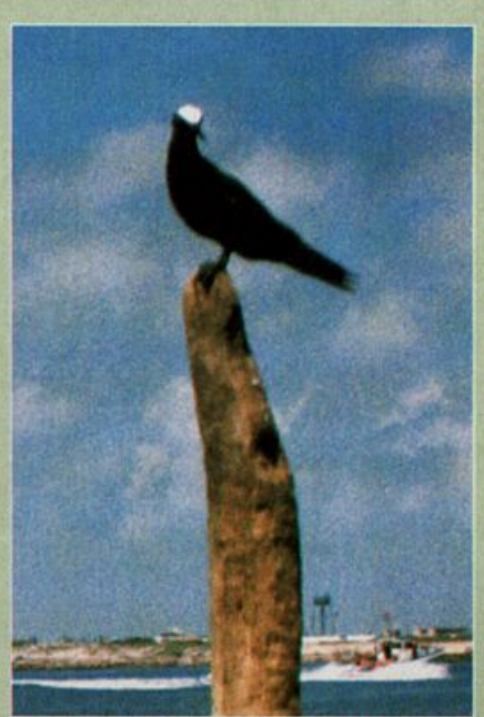
Following the extraordinary Black Noddy from spring 1998, yet another materialized on the Texas coast. This individual was photographed at St. Joseph's Island, Aransas County, on July 27, 1998. The appearance of this species in the Gulf of Mexico is unexpected as it currently nests no closer than the southern Caribbean Sea. Perhaps the source of such birds is similar to that of the small nonbreeding population on the Dry Tortugas in Florida. Pending committee review this would be the third for Texas.