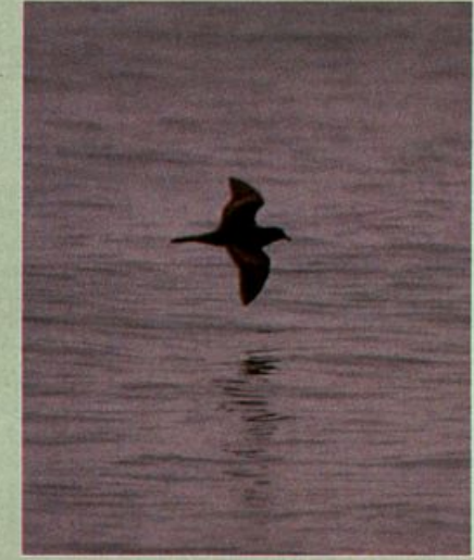
The first photograph from North America of Bulwer's Petrel and the first record for California was made in Monterey Bay, Monterey County on July 26, 1998. Note the small bill and head, long tail, and pale wing panel or ulnar bar ("carpal bar"-sic) contrasting with the otherwise very dark brown plumage.