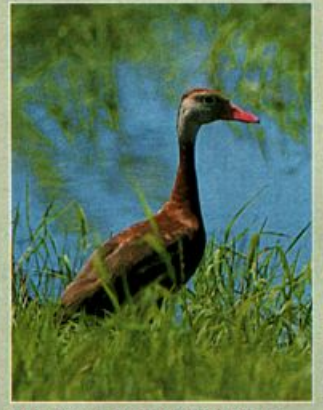
This Black-bellied Whistling Duck, on left, in Steele County on June 22, 1998, was the fifth for Minnesota and one of a few