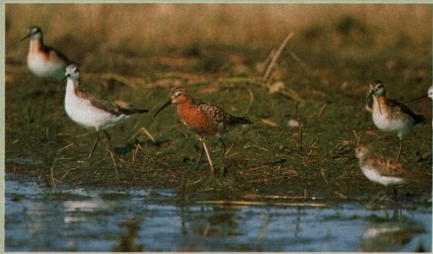
Perhaps because alternate plumaged birds are relatively easier to spot and identify, Curlew Sandpiper is traditionally a late spring and summer rarity. Colorado's first at Upper Queens Reservoir, Kiowa County, here shown on July 1, 1998, flanked by two Wilson's Phalaropes and a Western Sandpiper, was no exception.