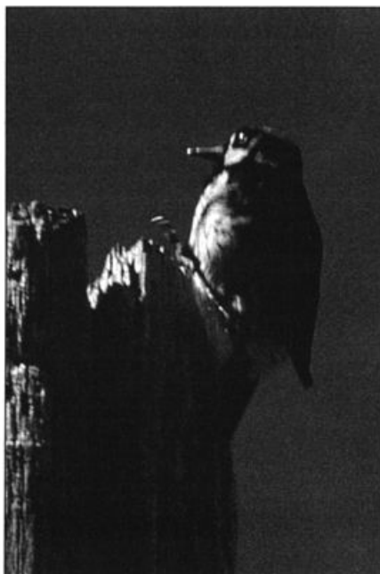
This is one of at least three Acorn Woodpeckers that stayed at Durango, La Plata County, Colorado, until June 12, 1998. Although breeding remains a possibility at this site, it has yet to be confirmed. The nearest nesting populations currently recognized are across the state line in New Mexico.

Single E. Wood-Pewees were seen in Baca , CO, June 4-8 (DSv, m.ob.) and Sawhill Ponds, Boulder , CO, July 30-31 (BT, m.ob.) Twelve Least Flycatchers were reported from seven e. Colorado counties; one s.e. of Saratoga, WY (JDo, RDo); and the species continues to expand in Utah