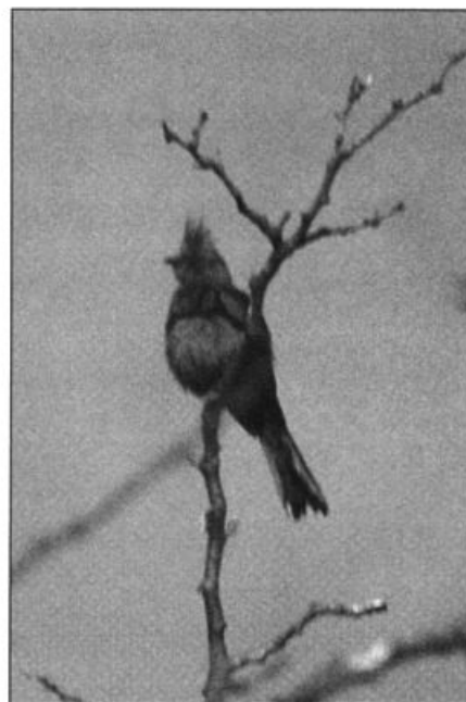
Phainopepla remains a scarce visitor to Colorado. This female, one of two reported there this summer, was seen on the Great Plains at Prewitt Reservoir, Washington County, for three days and was photographed on July 23, 1998.

From 10-50 Purple Martins were at Colbran, Mesa , CO, June-July (CD), and three female/immatures were at Sterling, Logan , CO, July 30 (JDe). A Blue Jay in Salt Lake , UT, July 5 ( fide MSt) provided the first July record for that area. Winter Wrens nested in Cache , UT, July 3-9 (JG, RR), providing the 2nd breeding record for Utah. A very late Ruby-crowned Kinglet was in Lamar, Prowers , CO, June 2 (VAT). Eastern Bluebirds were reported nesting in 3 e. Colorado counties. A singing Veery was at