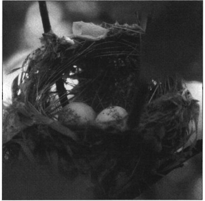
The usual western edge of the Hooded Warbler's breeding range barely reaches the eastern edge of the Great Plains states. This nest provided the first evidence of nesting in Colorado at Gregory Canyon, Boulder County. The female was found on the nest on July 1, and the eggs were first seen on July 4, 1998. Juveniles were found on July 31. Also present here was a Kentucky Warbler, presumably making the woods sound more like Missouri than Colorado.

two males were on McClure Pass, Pitkin , CO, June 18 onward (JBH, VZ). Gregory Canyon also had a male Black-throated Blue Warbler June 9 (DS, m.ob.). A Pine Warbler was in Baca , CO, June 17 (DSv et al.). In Nevada, a Palm Warbler was banded at the Numana MAPS station June 12 (EA, RN), and a male Blackpoll Warbler was in Clark June 5 (RS). Also, two Black-and-white Warblers were in Clark June 11 (JE), and there was a rare summer record of a singing male in Cheyenne, WY, July 16 (RDo). Am. Redstarts were at Owl Spring, n. of Lucin, UT, June 5 (RCH), and in Esmeralda , NV, June 5 (RF). A male Prothonotary Warbler in Grand , UT, June 2 (PR) furnished the 2nd Utah record. Rare in that state, an Ovenbird was in Washington June 3 (SP). Rare in summer, a N. Waterthrush was in Yuma , CO, July 19 (CLW). A singing male Kentucky Warbler was in Gregory Canyon, CO, June 6–27 (PP, m.ob.). A pair of Hooded Warblers in Gregory Canyon confirmed the first state nesting record. (RSi, GB, m.ob.); two juveniles were found July 31 (BT).