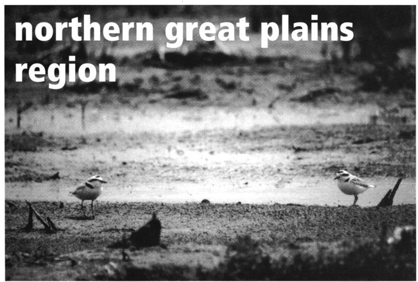
These Snowy Plovers on June 14, 1998 attempted to nest at Bowdoin National Wildlife Refuge, Montana. This was the third record for the Big Sky State.