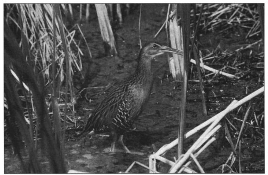
Perhaps a dividend of the recent series of wet years was this King Rail at Quivira National Wildlife Refuge, Kansas, May 8, 1998.