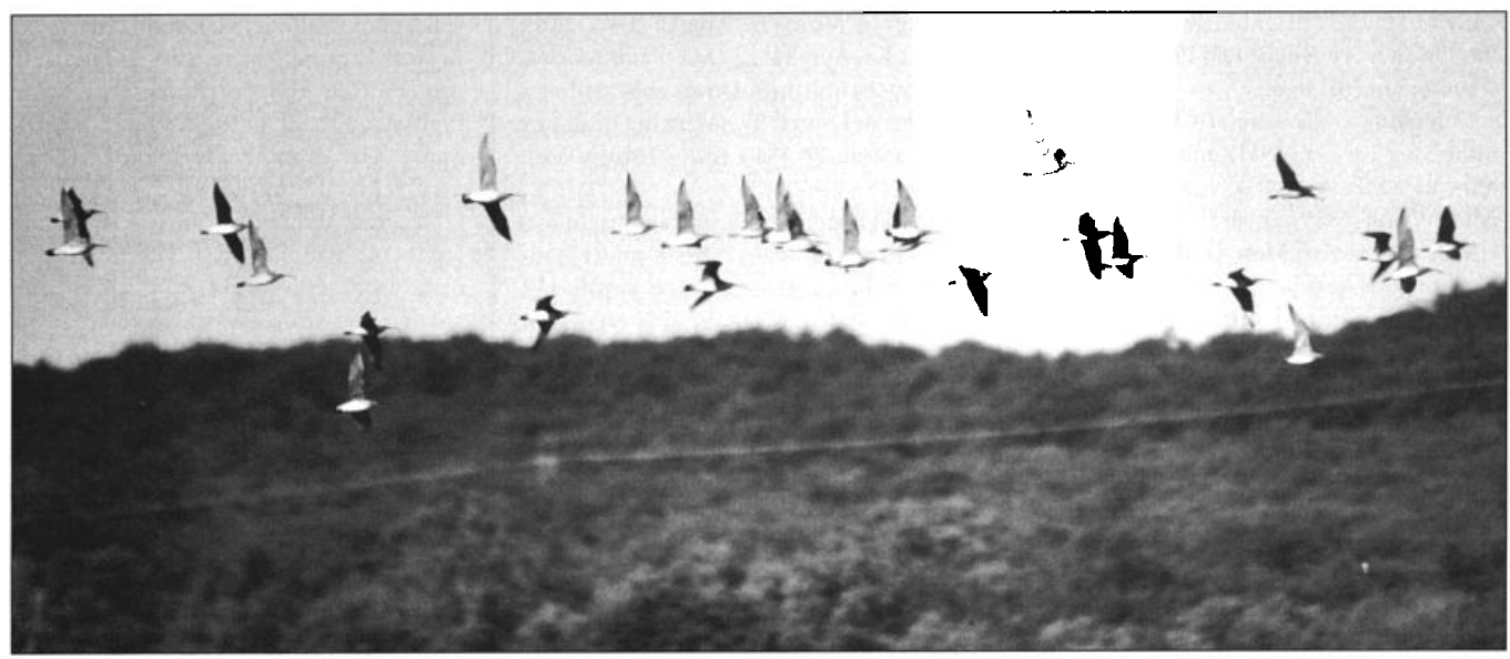
Part of an astounding concentration of 119 Whimbrels observed at Lake Keystone, Osage County, Oklahoma, May 16, 1998.