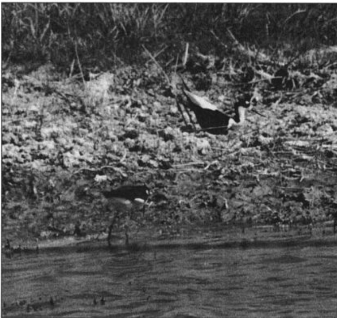
Black-necked Stilts may be occurring more frequently in Alberta than in the past. This nesting pair was near Irricana, Alberta, May 18, 1998.