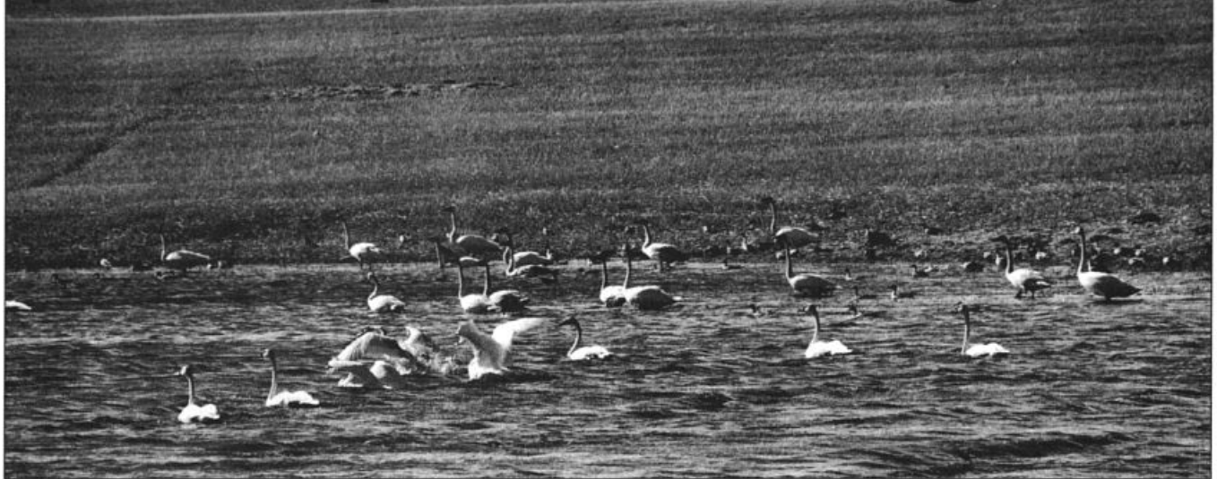
Part of a notable concentration of 70 Trumpeter Swans present April 11, 1998, west of Nanton, Alberta.