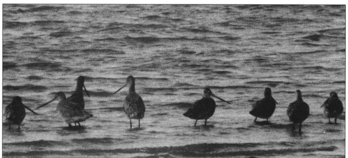
A notable concentration of eight Marbled Godwits was observed at Caesar Creek State Park, Ohio, April 26, 1998.

Eighty-four male Greater Prairie-Chickens were counted at in Jasper, IL, in April (SSi, JW et al.), and extralimital birds, a male and possibly two females, were discovered e. of Enfield, White, IL (†DvW). A better-than-average rail flight was highlighted by single Yellow Rails at Santee Prairie, IA, Apr. 10 (M. Muhm, fide DH) and in Champaign, IL, Apr. 22 (RCh). Single King Rails were seen at Miami–Whitewater in s.w. Ohio May 2 (PW) & 17 (JBe). Virginia Rails were widely reported and a nest containing