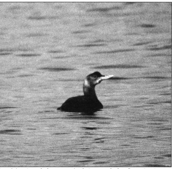
Remaining through the season (and photographed on December 9, 1997) was this Yellow-billed Loon in first-winter plumage at Crescent Beach, Surrey, British Columbia.