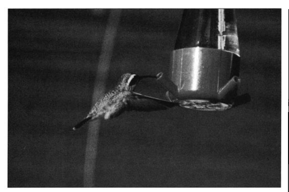
The remarkable Xantus's Hummingbird at Gibson's, coastal British Columbia, first discovered in November 1997, remained through the winter, and was photographed on January 14, 1998. An additional photo of this bird appeared in the preceding issue of Field Notes.