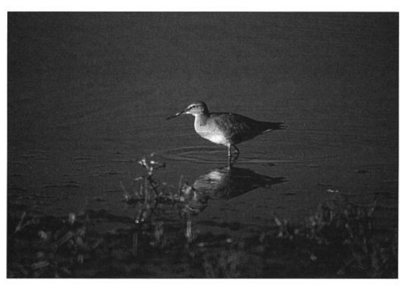
At a small sewage pond south of Farmington, New Mexico, in the arid Four Corners region, a coastal species like this Wandering Tattler was a most unexpected visitor on October 4, 1997. Some observers reported hearing the callnotes that would rule out the very similar, and remotely possible, Gray-tailed Tattler.

Single American Golden-Plovers were at E.B.L. Sept. 6 (JEP, DE, BN, ph. JO) and at Onava, San Miguel , Sept. 24–25 (WW,