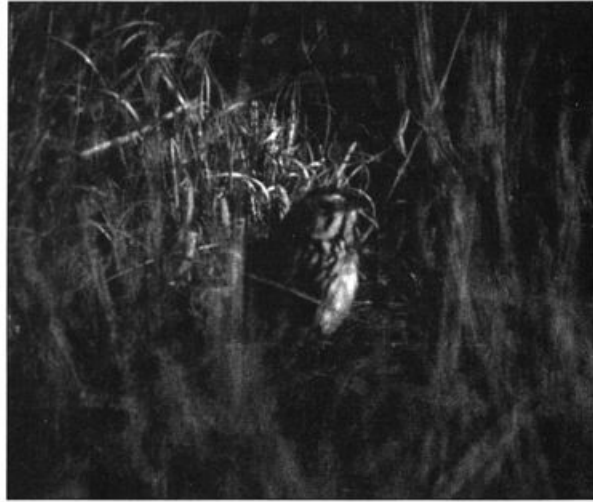
Now considered rare in New Mexico, and seldom well documented there, this Baird's Sparrow was near Cloverdale in the Animas Valley on November 29, 1997.