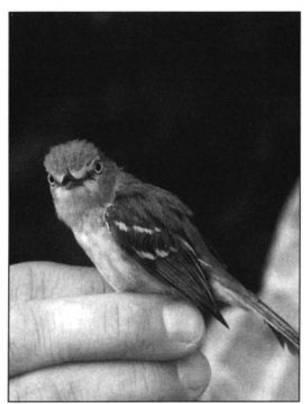
At the Turkey Creek MAPS station in El Paso County, central Colorado, this White-eyed Vireo was captured for banding on June 17, 1997.

Gray Warbler was reported from Fallon, NV, June 21 (RF). Other late migrants were a singing male Prairie Warbler at Bonny Res., Yuma, CO, June 1 (DQ, GE); a Baybreasted Warbler at Wellington, CO, June 2 (S&KM); and an Am. Redstart at Corn Cr., NV, June 6 (RPS). A N. Waterthrush remained in Wayne, UT, May 30–July 1 (AS). Possibly the rarest warblers this season occurred in Nevada, with a Louisiana Waterthrush at Ruby Lake N.W.R. July 26 (JRT) and a Canada Warbler along Corn Cr. June 6 (RPS).