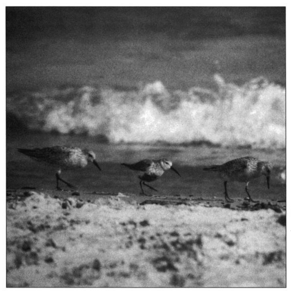
Two Red Knots (flanking a Dunlin) on Montrose Beach, Chicago, Illinois, on June 1, 1997. Knots are scarce in spring in the upper Midwest.

was logged at Union Slough N.W.R., IA, June 18 (NK). A Snowy Plover near Black Hawk L., IA, June 14-15 provided Iowa's first summer record (†PA, RA, †PE). Also in Iowa, Piping Plovers had their best year ever at the traditional Port Neal nesting site, where at least 20 young were fledged (BH). In addition, three pairs were noted at the Pottawattamie, IA, power plant ponds June 23-24 (JD). A fine post-breeding Killdeer concentration occurred at Morgan's Pond, Christian, KY, when 200 were counted July 27 (MB). Black-necked Stilt reports included at least two at Cape Girardeau, IL, July 21 (RM et al.); three with young in New Madrid, MO, July 16 (BJb, AS); and three in Stoddard, MO, July 16 (BJb, AS). American Avocets were reported in all 6 states; the peak count consisted of 14 at Lorain, OH, July 26 (RHa, SW). Rarely seen in spring, two alternateplumaged Red Knots were present on Montrose Beach, Chicago, June 1 (ph. JLa). Noteworthy fall migrant counts included 5000 Lesser Yellowlegs at L. Chautauqua, IL, July 28 (RCh et al.); 24 Solitary Sandpipers in Arcola, IL, July 19 (RCh); three Whimbrels in Cleveland July 39 (JPg); three Marbled Godwits in Dickinson, IA, June 21