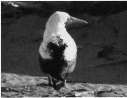
Present for a month in January and February 1997, this near-adult Masked Booby at the Point Mugu Naval Air Station furnished a ninth record for California.

A Laysan Albatross caught in San Pedro, Los Angeles , in mid-January was released far off Pt. Conception, Santa Barbara , Feb. 1 (MH), in an area where \geq three others were seen during February (MH, RR). A Manx Shearwater was reported during an organized pelagic birding boat-trip off Morro Bay, San Luis Obispo , Jan. 19 (BKS, AS); sightings of this species along the California coast are increasing.