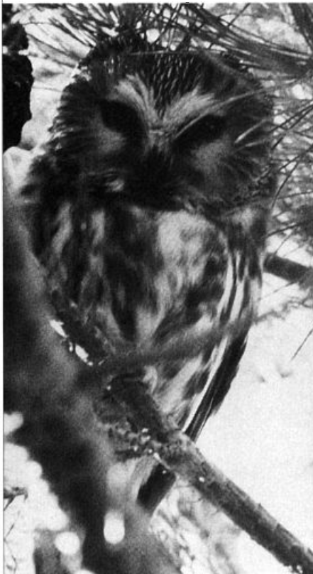
A rare visitor to the desert regions of southern California was this Northern Saw-whet Owl in a Christmas-tree farm near Ridgecrest December 6, 1996.

The number of White-winged Doves wintering along the w. edge of the Colorado Desert in e. San Diego increases each winter, with flocks of 10–15 present at multi-