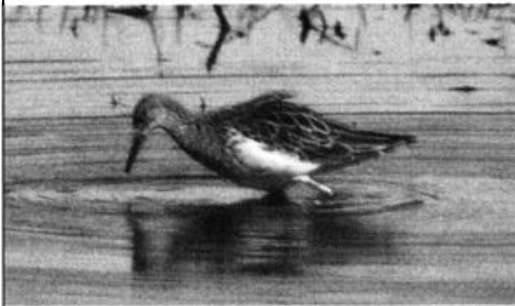
Ruff foraging near Point Mugu, California, February 22, 1997.

sheep near Brawley Jan. 31 (RHigson) was the 2nd to be reported in Imperial , but the condition of its wing-feathers suggested it had recently been in captivity.