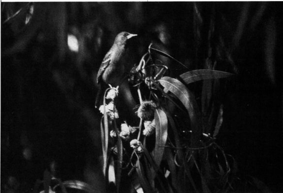
Providing a sixth record for California, this Streak-backed Oriole (photographed January 3, 1997) remained for three months in a small park in Huntington Beach.

probably wintering locally. The only Chestnut-collared Longspurs reported were two near Lakeview Jan. 31 (CMcG).