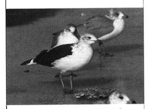
Lesser Black-backed Gull (with Ring-billed Gulls) at Sloan's Lake, Denver, Colorado, January 6, 1997.