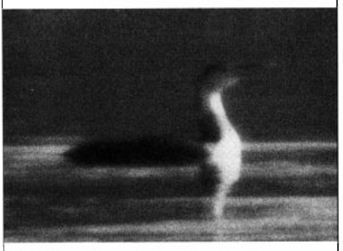
Continuing a recent pattern of this species wintering in the interior, this Yellow-billed Loon was at Mud Lake, Nevada, December 18, 1996.

Red-throated Loons scattered throughout the Region, with an adult at Cherry Creek