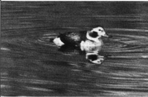
Oldsquaw at Marsing, Idaho, in February 1997. The bird remained all winter.