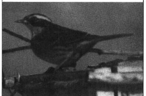
Perhaps the most sought-after individual bird ever in Idaho, this Siberian Accentor—only the second ever for the lower 48 States—was present for more than two months near Hailey, at least from late December 1996 into March 1997.