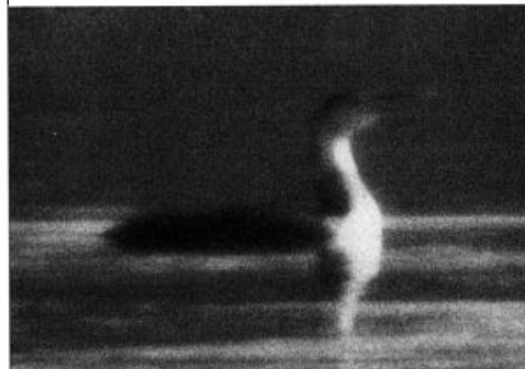
Continuing a recent pattern of this species wintering in the interior, this Yellow-billed Loon was at Mud Lake, Nevada, December 18, 1996.

Red-throated Loons scattered throughout the Region, with an adult at Cherry Creek