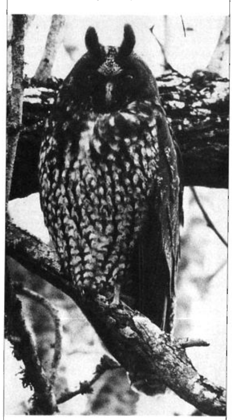
Considered by many to be the most extraordinary bird of many a year, this Stygian Owl— a little-known bird of the American tropics—was seen for one day only at Bentsen State Park, Texas, December 26, 1996. Far from known localities in Mexico, it furnished a first record for the United States.