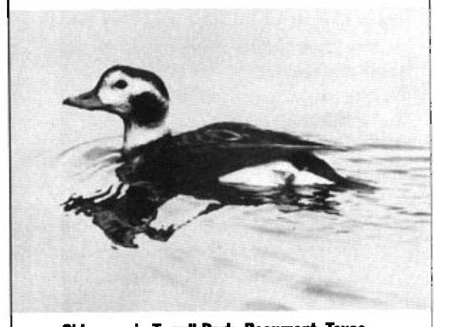
Oldsquaw in Tyrrell Park, Beaumont, Texas, December 14, 1996.

another at Mad I., Dec. 23 were notable. Unusual in the Panhandle were two Redbreasted Mergansers at Buffalo L., Randall , Jan. 9 (LN). Four Ruddy Ducks at Big Bend Feb. 16 (AW) provided an apparent first winter record for the park. "Several" Masked Ducks were at Brazos Bend Dec. 22 to at least Feb. 15 (ph., m.ob.).