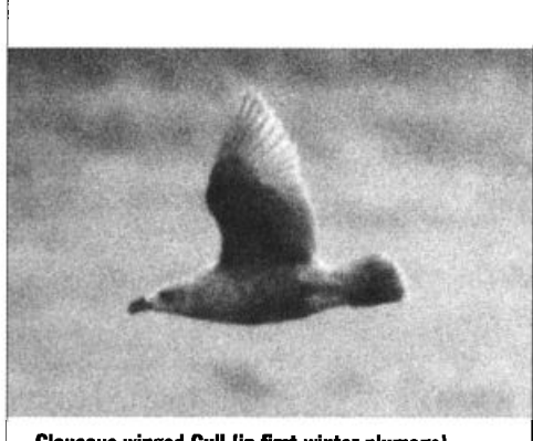
Glaucous-winged Gull (in first-winter plumage) at Riverlands Environmental Demonstration Area, Missouri, February 8, 1997. First state record.

Following the pattern of recent years, there was another fine winter gull flight, with both large numbers and excellent diversity. Most unusual for midwinter was an alternate-plumed Franklin's Gull at Saylorville Res., IA Jan. 3 (SD). Up to five Little Gulls were reported on L. Erie; the Region's only inland Little Gull was an adult at Clinton L., Dec. 1 (RCh). Enormous Ring-billed Gull counts were logged; the peak tally was 65,000 at Red Rock Res., IA Dec. 7 (SD). In addition, an estimated 20,000-30,000 Ring-billed/Herring gulls were at Mel Price Lock & Dam, IL Jan. 20 (JVb), >50,000 were seen in the tailwaters of Kentucky and Barkley Dams, KY (CP), and 90,000-200,000 were estimated to be concentrated at R.E.D.A. (DE). The only Mew Gulls were in Indiana, where single adults were seen at Michigan City Harbor Dec. 14 (JMc, †JCd, JWh) & 31 (†Jmc, ph.). Adult California Gulls were documented at Michigan City Harbor, IN Dec. 21 (JMc, †JCd, †KB, DH) and Eastlake, OH Feb. 9 (†KMt, LRo). Thayer's Gulls were unusually widespread, with multiple reports from all 6 states; the largest single count consisted of 12 at Michigan City Harbor and nearby LaPorte County Landfill, IN Dec. 21 (KB, JCd, JMc, DH). Iceland Gulls invaded the Region in unprecedented numbers; season totals included 23 in Indiana, >ten in Illinois, eight in Ohio,