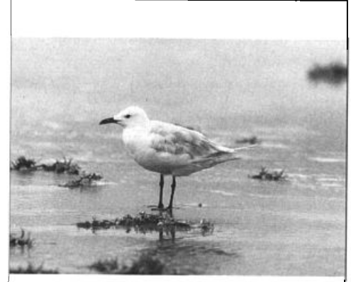
Albinistic Laughing Gull at Mustang Island State Park, Texas, on August 24, 1996. This bird easily could have been misidentified by incautious observers.

A Parasitic Jaeger at L. Tawakoni Aug. 12 (ph., MWh) was very unusual, but a welldescribed ad. Long-tailed Jaeger there Nov. 5 († MWh) was even more so. A dark-morph jaeger (Parasitic or Pomarine) was in Upton Nov. 13–16 (JWim, RMS, ph., GG). Any jaeger is very rare in w. Texas. An albino Laughing Gull was on Mustang I., Aug. 24 (WS, BF, CS, ph., GL). There were at least a dozen records of inland Laughing Gulls statewide from El Paso to far n.e. Texas (m.ob.). An amazing