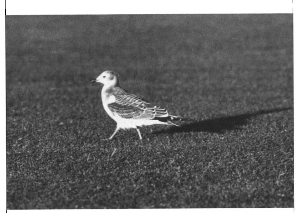
A juvenile Sabine's Gull at the Valley View Golf Course, Bozeman, Montana, September 13, 1996.

was at A.F.R., Sept. 2 (CT). An imm. Short-billed Dowitcher was at Mann L., Aug. 23 (KD, DNS, ICS).