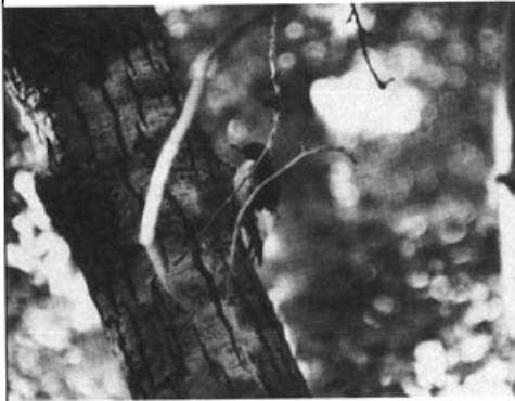
Adult Red-headed Woodpecker at Carburn Park, Calgary, Alberta, August 16, 1996.

maximum of 16 Aug. 27 (PSh, JS, DA); one Sept. 29 (JS) was record-late. Nine White-throated Swifts at Mt. Lorette Sept. 13 (PSh, TB, BE) were the first documented in Alberta, although just 100 km from their nearest breeding locality in British Columbia. An ad. Red-headed Woodpecker was far out of range at Calgary Aug. 11–25 (SK, m.ob., ph.), and one of the Medicine Hat birds was still present Sept. 28 (BV).