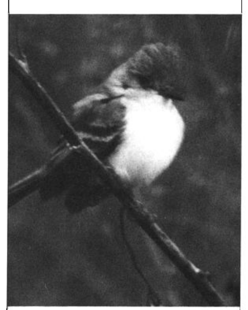
Ash-throated Flycatcher at Cape May, New Jersey, November 14, 1996.