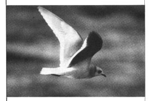
A first for Delaware, and probably the southernmost yet on the Atlantic Coast, this adult Ross's Gull was present for two weeks after its discovery November 16, 1996, at Indian River Inlet.

Now that Lesser Black-backed Gulls winter regularly in this Region, we can stop reporting individuals and look for patterns. Evidence of southbound movement along the coast was provided by five adults at Hook Pond, East Hampton, LI Oct. 19 (AW, AJL, AGt), as was five on the s. fork of Long Island Nov 9 (AW, AJL). They continue to increase around Niagara, where one in 2nd-year basic plumage Aug. 23 represented only the 2nd area summer record; ≤three were in the Niagara R. by late November. Blacklegged Kittiwakes were above average in the Rochester area, where 16 passed Hamlin Beach Nov. 22 alone; one-two in November in the Niagara R. were more normal. An immature at the Conejohela Flats Nov. 30 would, if accepted by the Pennsylvania Ornithological Records Committee, constitute the first 20th century Lancaster record (RW). The prize gull this season was Delaware's first Ross' Gull, at Indian R. Inlet Nov. 16-30 (BP, ESh, ph NP, m.ob.). Fran downed one Sabine's