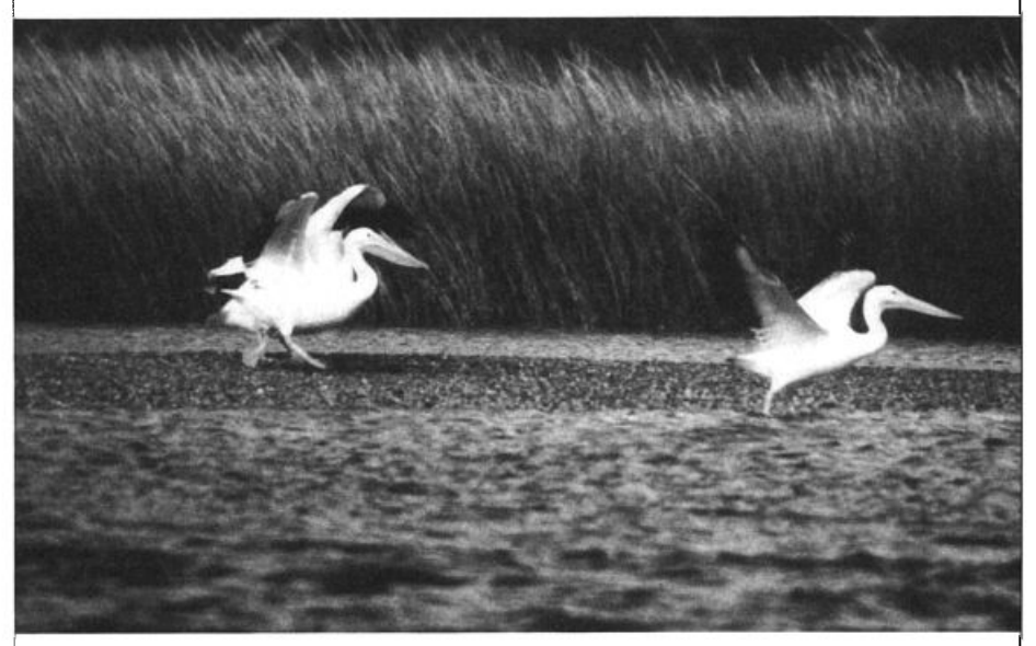
American White Pelicans near Southampton, Long Island, New York, October 5, 1996. Record numbers of this species were wandering through the Region during the fall.

An Anhinga flew into New York State from the Greenwich, CT, hawk watch Sept. 14 (TWB), but this increasingly reported southern straggler remains poorly documented in this Region. Only