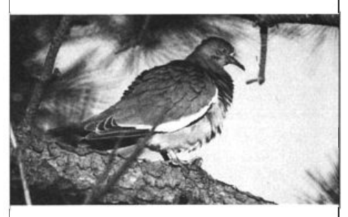
White-winged Dove at Jones Beach, Long Island, New York, October 29, 1996.