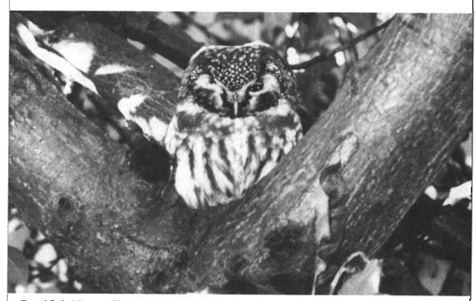
Boreal Owl at Newton, Massachusetts, October 31, 1996.