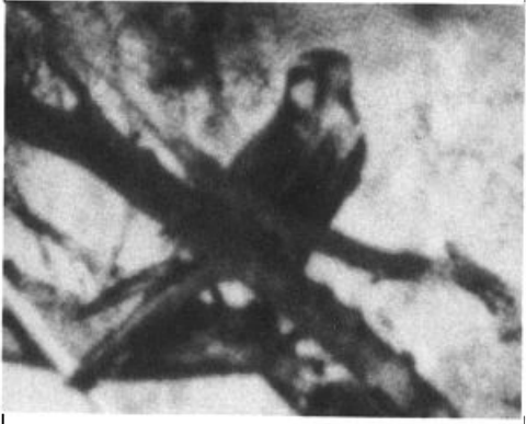
Aplomado Falcon, apparently a juvenile, near Las Cruces, New Mexico, July 20, 1996. This was the third recent state record to be photographically confirmed. No current nesting locations are known in New Mexico, but this bird could have fledged from the population in northern Chihuahua.