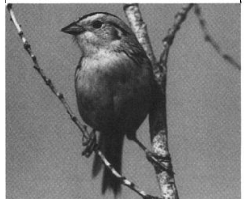
Le Conte's Sparrow at Churchill, Manitoba, June 25, 1996.

~ Three N. Cardinals, including a female, frequented White Bear L., SK, and a probable abandoned nest was found ( vide BL). A Black-headed Grosbeak was rare at Banff N.P., AB May 28–June 1 (M&JM). Three Lazuli Buntings were found well n.e. of their breeding range in Alberta, at Wabamun June 1 (MV), Wainwright June 5 ( vide PM), and Redwater June 5 (ph. MF), and one was at Good Spirit Lake P.P., SK June 1 (JA). Extralimital \delta Indigo Buntings were observed at Birch R., MB May 29–June 1 (IH), Raven, AB May 30 (R&JD), and Windy Pt., AB June 16 (JRi), while four were found at the fringe of this species' range in and near the