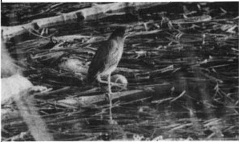
Green Heron at Fish Creek Park, near Calgary, Alberta, June 3, 1996.

noted in Saskatchewan at Cypress L., June 13 and Pelican L., June 16 (both RKR); \leq three Buffleheads were seen at Churchill in early July (m.ob.). Over 60 Swainson's Hawks were soaring near Del Bonita, AB July 5 (TD), an unusual date for such a concentration. A 46% nest-failure rate and productivity of only 1.48 fledged young per successful nest were the 2nd-worst figures in a 30-year study of Swainson's Hawks in Saskatchewan (SHs). Ferruginous Hawks also fared poorly, with 30% failure and 2.24 young per successful nest in Saskatchewan (SHs), and fewer than 50 young fledged by 58 pairs in s.w. Manitoba (KD). Red-tailed Hawks seemed to take over vacated Swainson's and Ferruginous hawk territories, but did not appear to fare any more successfully. A Rough-legged Hawk summered at Oak Hammock Marsh (RZ, RKO), and another was at Pierson, MB July 10 (AW, KD).