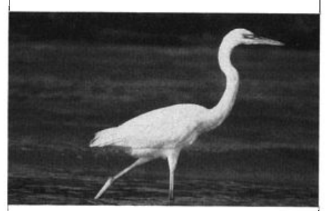
A remarkable find for New England was this bird, thought to be the "Great White" race of Great Blue Heron from the region of Florida and the Caribbean (rather than just an albinistic Great Blue), present on outer Cape Cod, Massachusetts, in July 1996.

If reports in recent years are at all indicative of their current status, breeding Am. Bitterns must be all but extirpated from s. New England. Only slightly more optimistic were reports of Least Bitterns from only 3 localities, the most notable being Cotuit on Cape Cod, MA June 5 (S&EM). Unquestionably the most remarkable wader report of the season was a white-morph Great Blue Heron first noted at Nauset Marsh, Eastham, MA at least as early as July 9 (K. Marty, D. Bessum, ph., v.o.). This report not only represents the first definitive record of the "Great White" Heron for the Region, but what may also be the northernmost record of this morph in North America. Previous extreme extralimital records include birds at Pymatuning L., PA May 14, 1938, and Long Island, NY Sept. 3-Oct. 15, 1949 (fide Bull, 1964, Birds of the New York Area). Because the data generated by the 1994-1995 United States Fish and Wildlife Service Atlantic Coast colonial waterbird census is currently unavailable, the reported numbers of breeding herons and egrets in all of the New England states must be viewed as incomplete. In Rhode Island, wader numbers were thought to be stable when compared with last season's totals (fide DE), and in Massachusetts, a wader pair count from Kettle I., Manchester, June 1 (SP) included 40 Great Egrets, 150 Snowy Egrets, 15 Little Blue Herons, and 60 Glossy