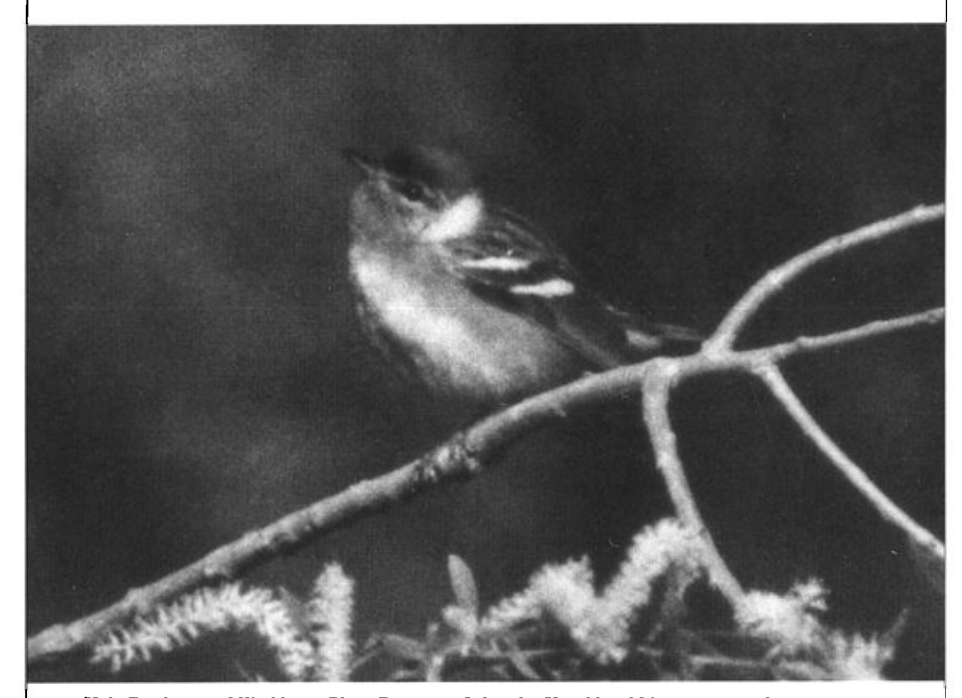
Male Bay-breasted Warbler at Dixon Reservoir, Colorado, May 20, 1996.

A ♀ Hepatic Tanager was seen at Apishapa S.W.A., Las Animas, CO May 21 (MCa). Seven Summer Tanagers were recorded in Colorado and a very rare one near Cody, WY Apr. 27 (ED). This species seems to be expanding its range and nesting may occur soon. Two Scarlet Tanagers were in e. Colorado, at Bonny Res., May