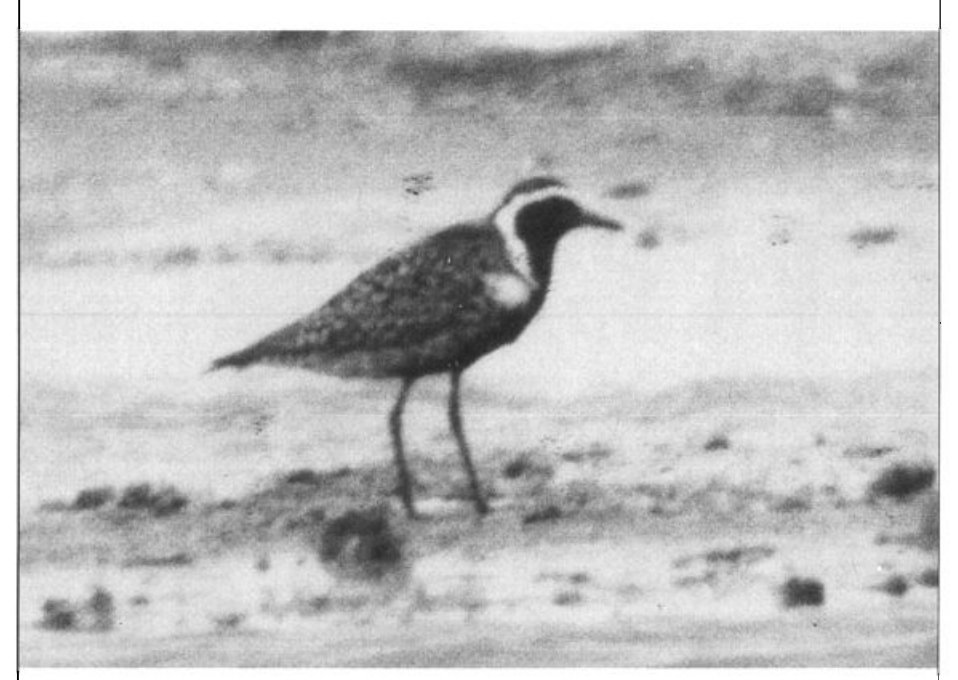
Golden-plover at Big Soda Lake, Nevada, May 17, 1996. Showing white along the sides under the wing, this bird was thought by the observers to be a Pacific Golden-Plover, not just an American Golden-Plover in molt; the status of the two golden-plovers in the interior of the west is still poorly understood.

Cherry Creek Res., Arapahoe, CO May 28-29 (BB) was rare away from its normal range in the state. A single Mt. Plover was at Overton W.M.A., NV Apr. 6 (JC, MC, ph.). Whimbrels invaded Colorado; flocks of <70 individuals were recorded at 11 locations. Two Hudsonian Godwits were recorded in e. Colorado: at Fort Collins May 2 (DCE) and Upper Queens Res., Kiowa, May 16 (JK, SS, PL). A rare Ruddy Turnstone was observed at Casper, WY May 15 (J&VH). The only Red Knot reported was at Upper Queens Res., May 16 (JK, SS, PL). A Dunlin at Fish Springs N.W.R., UT Apr. 25 (†EG) was well documented, and another visited Upper Queens Res., May 19 (BG). A Laughing Gull was at Union Res., Weld, CO May 7 (JPr) and at Casper, WY May 30 (†J&VH). In Wayne, UT, ≤ten Franklin's Gull were observed Apr. 11-22 (AS). A very late Glaucous Gull was at Antero Res., Park, CO May 24 (DP). A Least Tern was at Henderson Sewage Ponds, NV May 11 (†JE et al.), rare in Nevada, and another was in Grand Junction, CO May 30 (CD, RL et al.), very rare in w. Colorado.