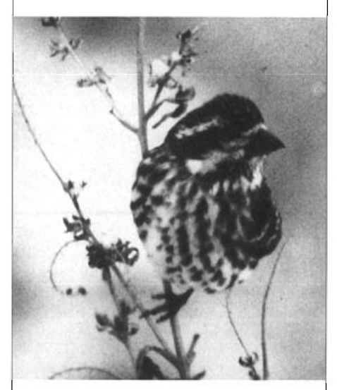
Female-plumaged Purple Finch in Baca County, Colorado, March 24, 1996.