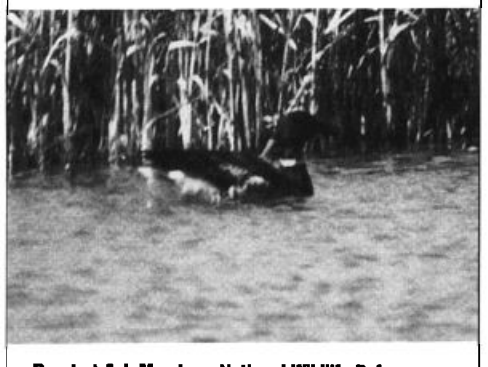
Brant at Ash Meadows National Wildlife Refuge, Nevada, April 7, 1996.

A Brant was at Ash Meadows N.W.R., NV April 7 (JC, MC, ph.) and 17 at Walker L., NV May 24 (NS). A & and & Am. Black Duck were at Hamilton Res., Larimer, CO Apr. 16 (RAR); the origin of this species is always debatable. Colorado's 3rd Garganey was a male at Boulder (same site as the 2nd record) Apr. 23–May 12 (BS, m.ob.). Same individual? Two & Eur. Wigeons were recorded at Sheridian, WY Apr. 10 (†HD, JW et al.), another two at Casper, WY Mar. 13 (J&VH), one in Iron, UT Mar. 31 (SDS), and one in Weld,