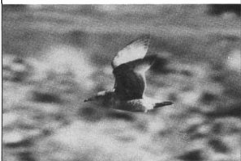
Mew Gull in first-winter plumage at Painted Rock Dam, Arizona, January 11, 1996. Sixth state record.