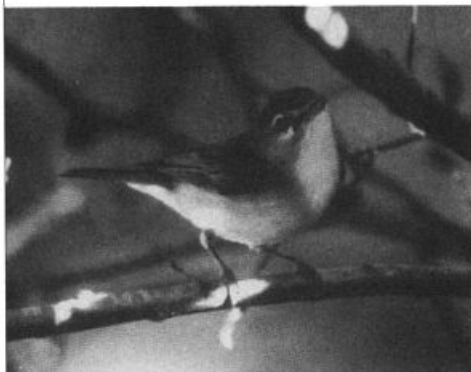
The latest of six Philadelphia Vireos in southern California this season was this bird at Morro Bay State Park November 23, 1995.