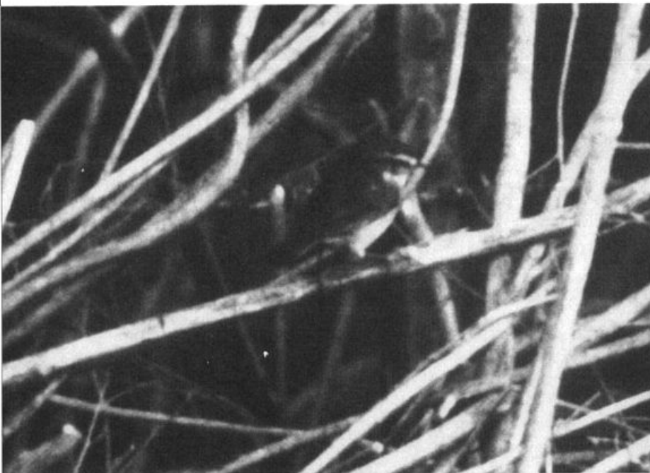
Dusky Warbler near the mouth of the Santa Ynez River, California, October 31, 1995. This Asiatic warbler has now been found in California five times, always in fall.

A Dusky Warbler photographed near the Santa Ynez R. mouth Oct. 31–Nov. 3 (BH) was the 5th to be found in California, the previous four also occurring in fall (between Sept. 27 and Oct. 22–23); these