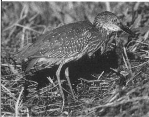
Juvenile Yellow-crowned Night-Heron near Point Mugu, Ventura County, California, September 4, 1995.

An imm. Tricolored Heron at the Tijuana R. estuary near Imperial Beach, San Diego , Nov. 3 (GLR) was the only one reported. A imm. Reddish Egret in Anaheim, Orange , Oct. 10–28 (DLP) was a few miles inland, and an adult at the Tijuana R. estuary Oct. 7–Nov. 26 (TRC, EM) was the same individual with a