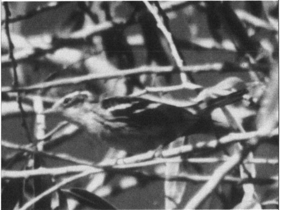
Immature male Blackburnian Warbler at Twentynine Palms, California, November 7, 1995.

Reports of our rare but regular vagrants indicated that average to above-average numbers of most were present, with some found inland as well as along the coast: six Tennessee Warblers along the coast between Sept. 15–Nov. 16, plus one inland at Galileo Hill Sept. 23–28 (CB); five N. Parulas along the coast between Aug. 20–Oct. 21, plus one inland at Cactus City, Riverside , Oct. 1 (DMM); 17 Chestnut-sided Warblers along the coast between Sept. 30–Nov. 4, plus single birds inland near Independence, Inyo , Oct. 22 (A&LK) and at Galileo Hill Sept. 13–20 (KLG), as well as three more along the coast in November that appeared to be wintering; 13 Magnolia Warblers scattered throughout the Region between Sept. 23–Oct. 30; 10 Black-throated Blue Warblers between Sept. 24–Oct. 24, with half of these at oases in the high desert; nine Blackburnian Warblers along the coast between Sept. 17–Oct. 14, plus one photographed inland at Twentynine Palms Nov. 7 (EAC); six Prairie Warblers along the coast between Sept. 23–30, plus one inland near California City Sept. 30–Oct. 1 (RHe); a somewhat lower than expected 35 Palm Warblers along the coast between Sept. 18–Nov. 23, plus an average five inland at oases in the high desert during the same period; a somewhat low 31 Blackpoll Warblers along the coast