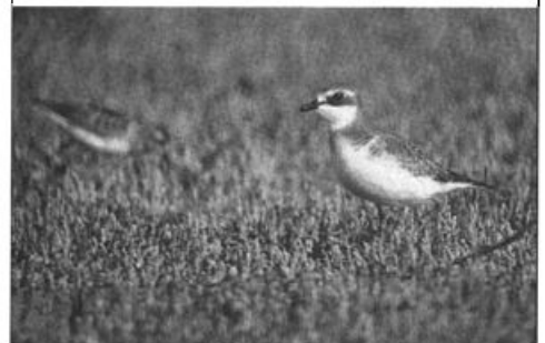
Juvenile Mongolian Plover near Point Mugu, California, September 7, 1995. Sixth state record.

The only migrant Am. Golden-Plovers were single birds near Port Hueneme, Ventura , Sept. 17 (MSanM), at Pt. Mugu, Ventura , Sept. 20 (AS), and near S.C.R.E., Sept. 26–27 (DDJ). A migrant Pacific Golden-Plover was at the Santa Maria R. mouth, Santa Barbara , Aug. 6 (JMC), two were in Goleta Nov. 2 (DDJ), and single birds were on San Elijo Lagoon in Solana Beach, San Diego , Aug. 1–10 (PAG) and Aug. 27 (K&CR); ≤five near Port Hueneme after Aug. 27 (DDJ) and three in Seal Beach, Orange , Aug. 18 (DRW) were at known wintering localities. A juv. Mongolian Plover photographed near Pt. Mugu Sept. 3–6 (DDJ) was the 6th to be found in California. A Mt. Plover at F.C.R., Sept. 24 (MAP) was a little early; single birds near Oxnard, Ventura , Oct. 31 (BL) and near Port Hueneme Nov. 26 (DDJ) were the only two found along the coast, and one at Tinemaha Res., Oct. 25 (T&JH) was at an unusual locality inland.