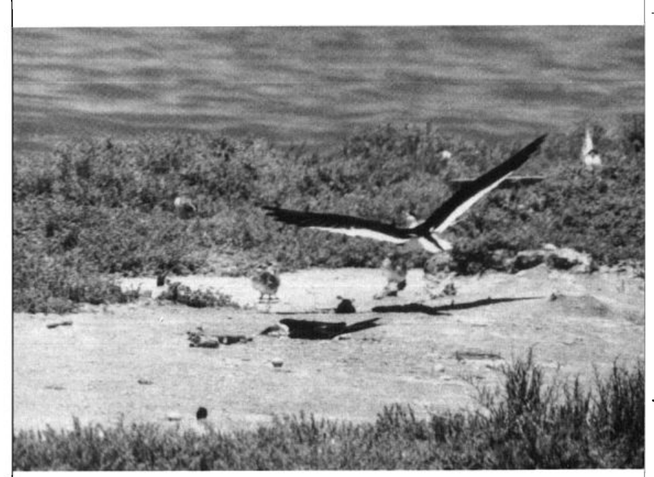
Pair of Black Skimmers at nest with eggs at Mountain View, Santa Clara, California, July 13, 1995.