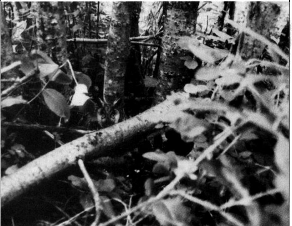
Long-eared Owl on nest on ground at Dawson Creek, British Columbia, July 8, 1995. (Two of the five large young are just visible under the diagonal cross branch.) Only a few ground nests of the species have been found in North America.