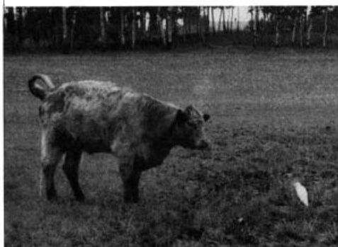
Cattle Egret [right, with one of the cattle] at Dawson Creek, British Columbia, June 5, 1995. First record for the Peace River region. Most previous records in British Columbia have been in fall or winter.