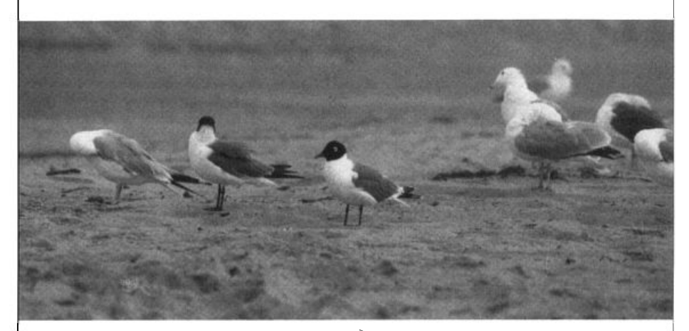
Adult Franklin's Gull (center, with Laughing and Ring-billed gulls) at Middletown, Rhode Island, July 28, 1995.

there are few cases where observers can properly document their presence and precise status in the offshore waters. An ad. Franklin's Gull was well photographed at Middletown, RI July 27 (LB). Three Little Gulls at Revere, MA June 18 (S. Zendeh) furnished a respectable number, but reports of five singles at 4 additional scattered locations were more in keeping with the current trend. The only Com. Black-headed Gulls reported were singles at Cutler, ME June 9 and July 8 (fide AB) and Plum I., July 1 (RH).