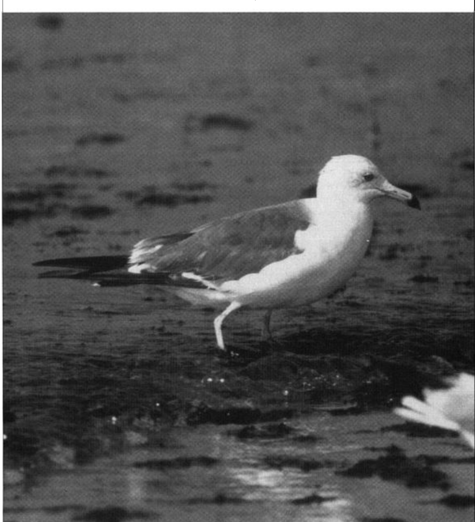
Black-tailed Gull at Middletown, Rhode Island, July 22, 1995. A first for New England, and only the third Atlantic Coast record of this Asiatic species.

The first fully documented and photographed Massachusetts Band-tailed Pi-