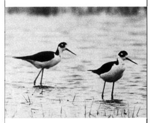
Black-necked Stilts at Cole Harbour, Halifax County, Nova Scotia, June 16, 1995. Third provincial record.

Three broods of Piping Plovers on the Isthmus, SPM furnished an encouraging local record (RE, DL). Still very rare, but becoming annual, American Oystercatcher was seen at Cape Sable I., NS June 22 (JN et al.) and Kent I., NB June 25 (fide DC). Two Black-necked Stilts were nicely photographed at Cole Hr., NS June 16 & 17, constituting the 3rd provincial record (IM et al.). There were 2 reports of Spotted Redshank from Nova Scotia: an adult in breeding plumage at St. Mary's, Isle Madame, July 9 (VK, SC) and one at Wallace Bay Bird