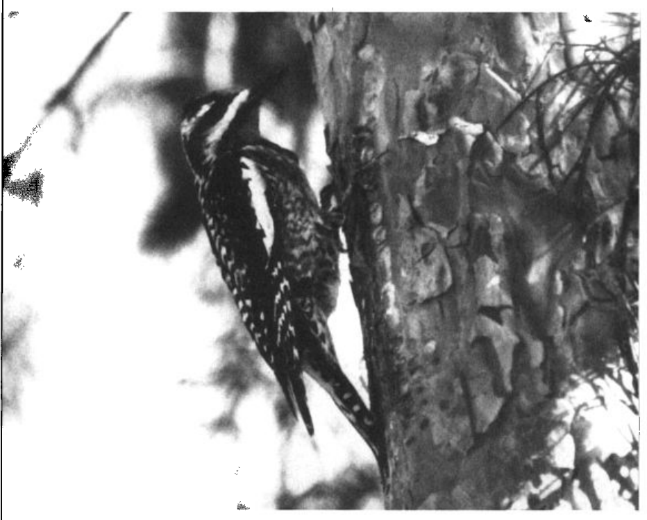
Adult male Yellow-bellied Sapsucker at Walsh, Colorado, March 21, 1995.